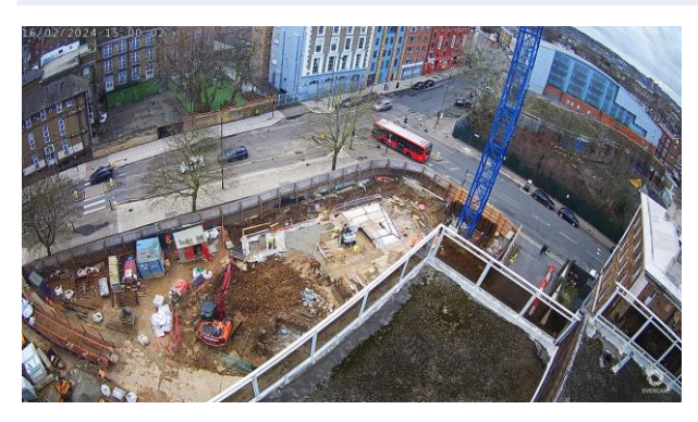
Block A Progress - Swaledale House