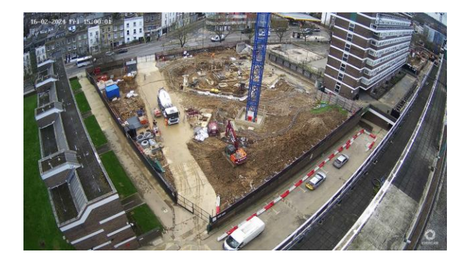
Block C Progress – Ryeland House