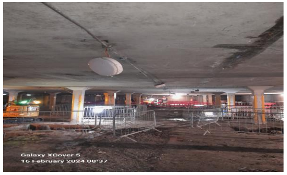
Block D Progress – Abderdale House