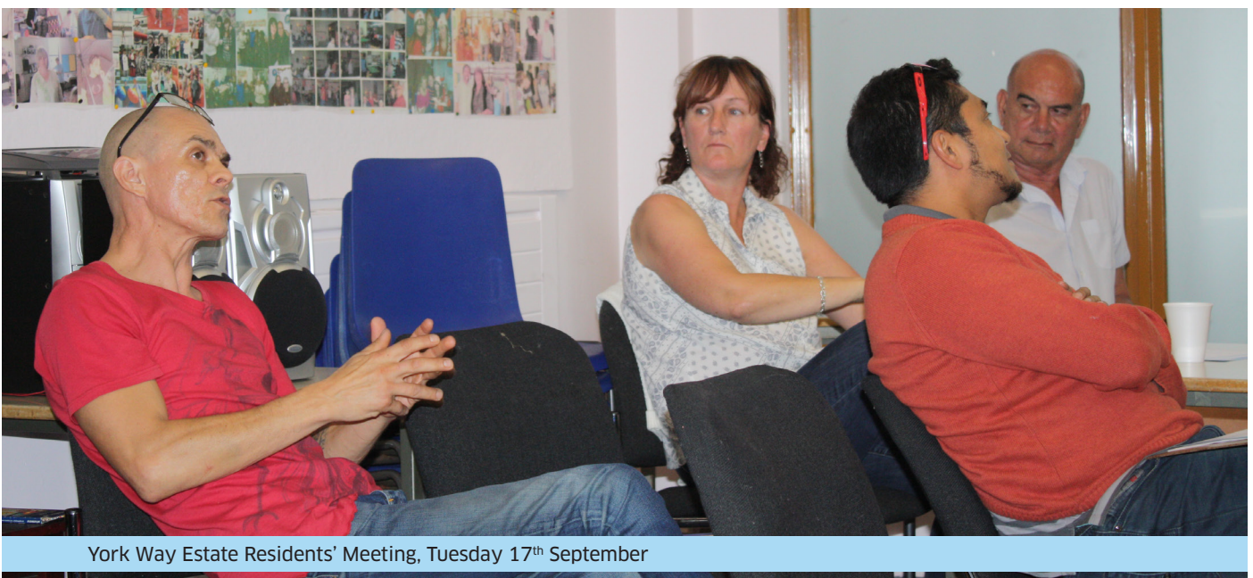
York Way Estate Residents' Meeting, Tuesday 17 th September